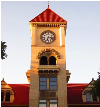
Whitman College 2017 $mart Business Partner Large Business Award Winner

Walla Walla Bread Company Walla Walla City Wastewater Treatment Plant Walla Walla Community College WW County Community Health Walla Walla Housing Authority WW Public Schools Facilities Support WW Public Schools Print Shop Walla Walla Recycling Walla Walla Senior Center Walla Walla Union Bulletin Walla Walla VA Medical Center WW Valley Chamber of Commerce Walla Walla YMCA Walla Walla YWCA Washington State Penitentiary Whitman College Whitman Mission National Historic Site